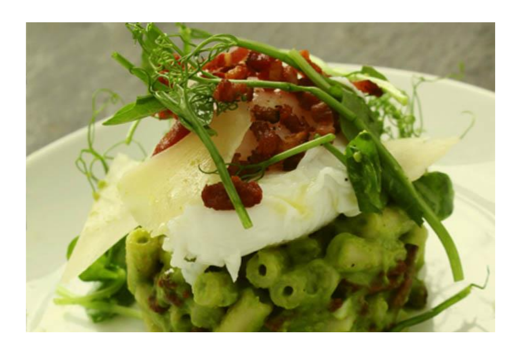
Prep & Cook Time: 30 minutes, Servings: 4 people