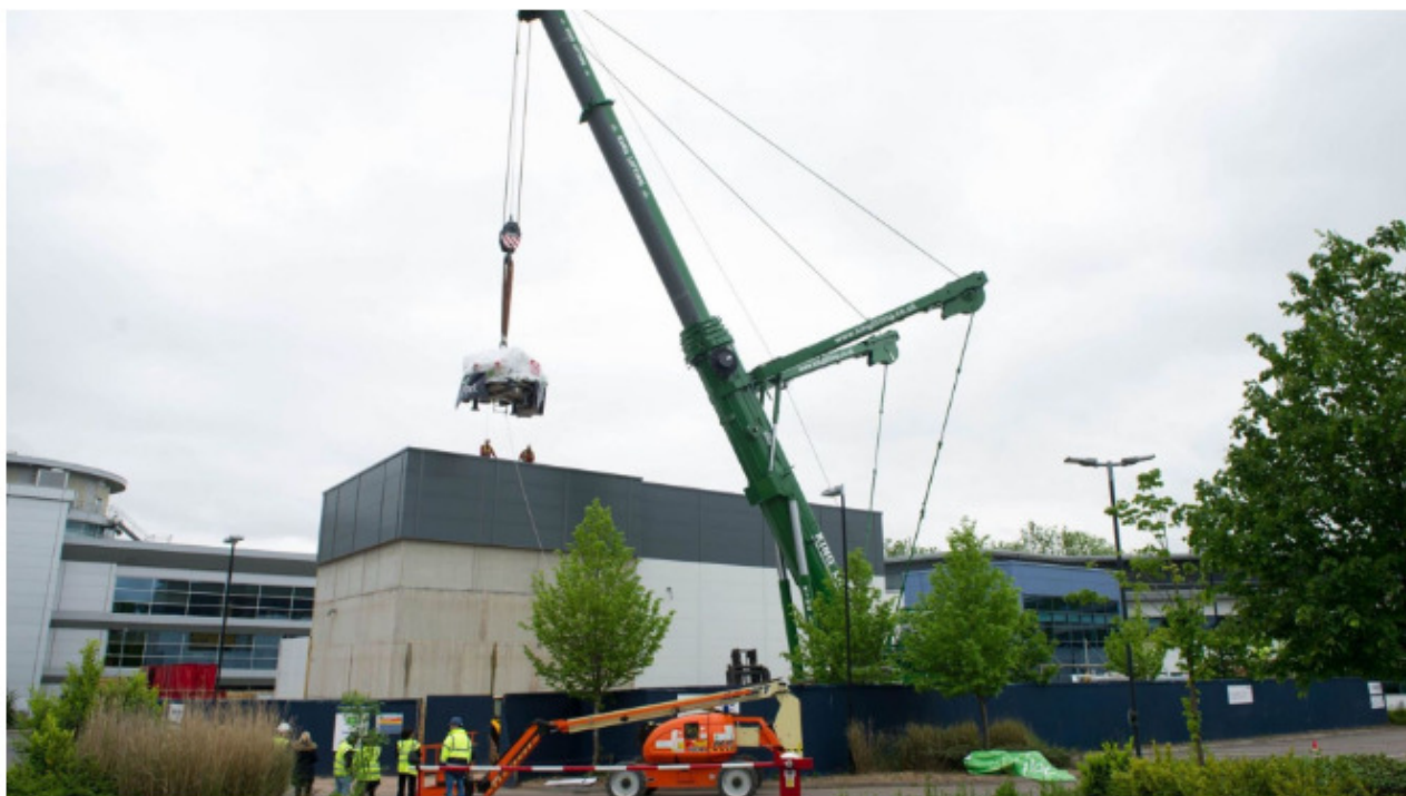
The proton beam therapy machine is hoisted into position

The UK has taken delivery of its first cancer-fighting proton beam therapy machine.